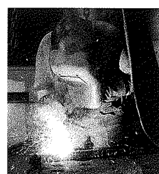
▪ Repair Spot