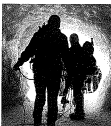
▪ Rescue Missions